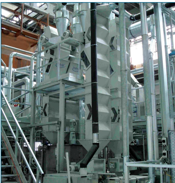
Fig. 1: Herbold air stream separator in a PET bottle washing line