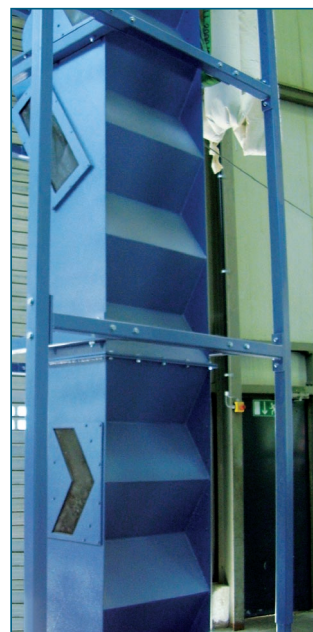
Fig. 2: Channel of an air stream separator