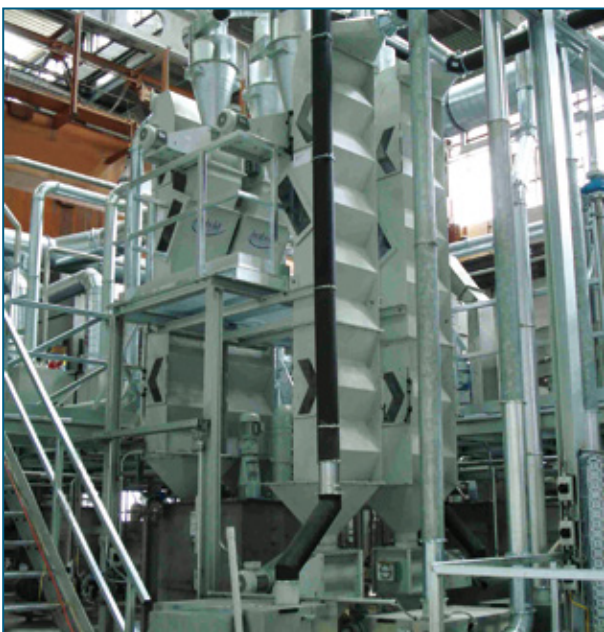
Fig. 1: Herbold air stream separator in a PET bottle washing line