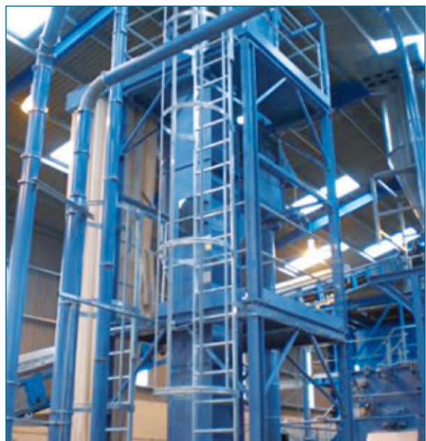
Fig. 2: Air stream separator with maintenance platform