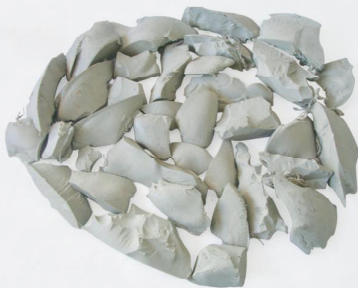
Typical granulate size after preliminary shredding approx. 50 - 100 mm

Only with such thick-walled rolled chips can easily-flowing material with a high bulk density be achieved in the following granulator.