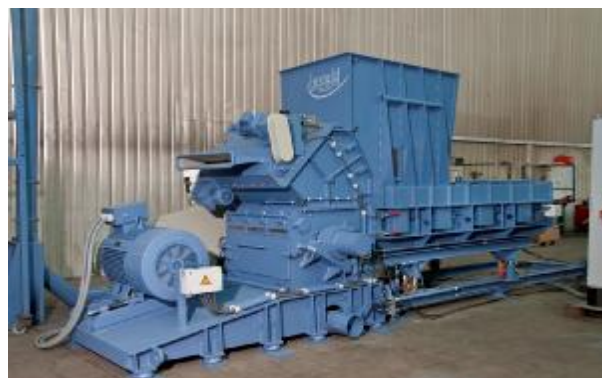
Fig.3:SML 60 /100 HB

Now it is possible in one single size reduction step with the HERBOLD granulator of the HB series. The design of the HERBOLD HB granulator is a combination of a feed hopper and a hydraulic ram with a granulator. Due to the special design of the grinding chamber and the high cutting frequency, it is now possible to transform bales, cut open film rolls, mingled packs of sprue spiders, but also extremely large and thick-walled purgings into the finished product in one single step.