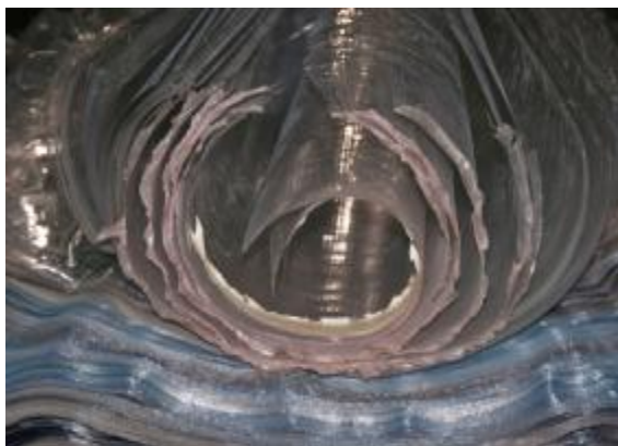
Fig .4: Cut open film rolls

Typical input material for the granulator of the HB series :