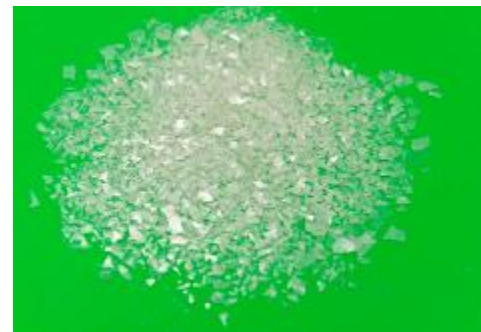
Fig. 2: Small granule size

Now it is possible in one single size reduction step with the HERBOLD granulator of the HB series. The design of the HERBOLD HB granulator is a combination of a feed hopper and a hydraulic ram with a granulator. Due to the special design of the grinding chamber and the high cutting frequency, it is now possible to transform bales, cut open film rolls, mingled packs of sprue spiders, but also extremely large and thick-walled purgings into the finished product in one single step.