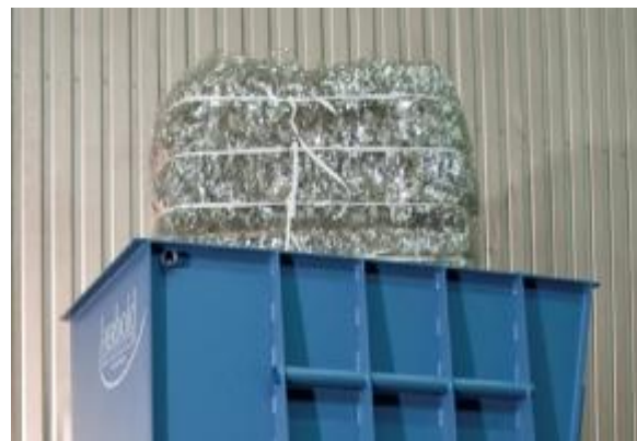
Fig.5: Film bales

The main advantage of this new development is its space-saving design since only one size-reduction step is necessary. In addition, only one size-reduction step also makes cleaning and colour and material changes much easier: there is no problematic and difficult to clean intermediate conveying by means of a belt conveyor. Only one machine will need knife change and maintenance, thus reducing maintenance times and costs. Compared to a two-step solution and a granulator fed by gravity, it has also a considerably favourable effect on the energy balance.