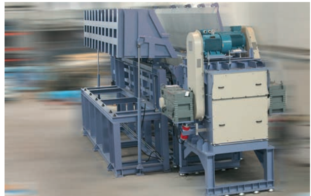
Step 2: Supply hopper "tips" the material into the hopper