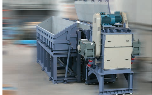
Step 1: Material to be fed in is put in the tiltable storage trough