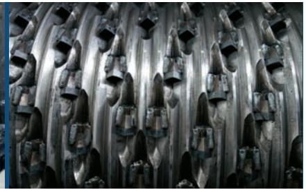
Fig. 3: EWS-R Rotor