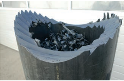
Fig. 1: Feed material e.g., PE pressure pipes