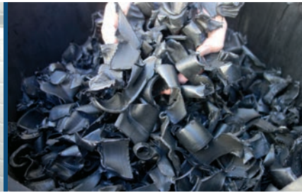
Fig. 2: End product