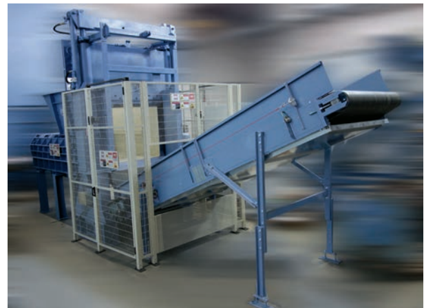
Fig. 1: Guillotine cutter HGS 150 with EWS hydraulic ram