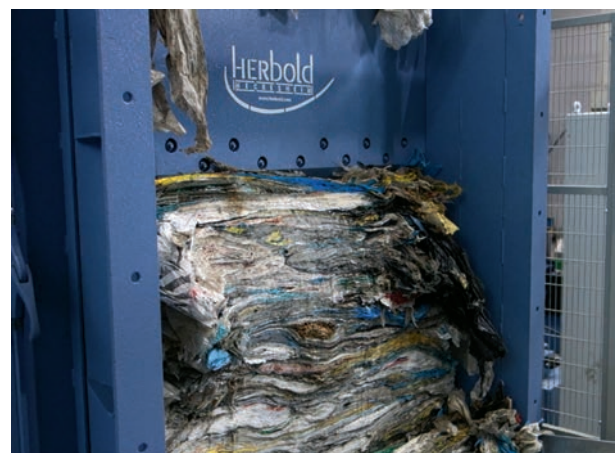
Fig. 2: Cutting the material portions lying under the cutting blade