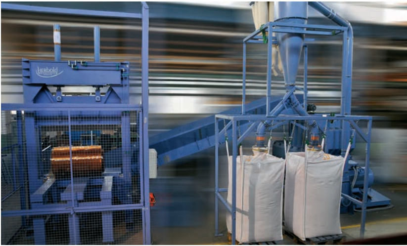
Fig. 3: Combination of guillotine and granulator with supply bunker

Safe handling of rolls that do not roll off, uncomplicated feed of cut sheeting parcels into the supply bunker of the granulator.