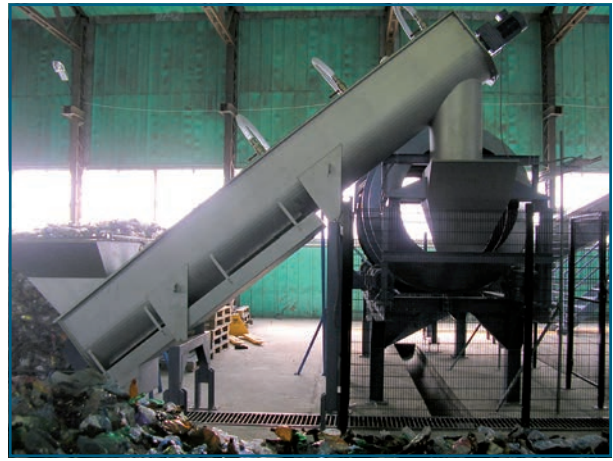
Fig.4: PET wash drum with upstream feeding screw